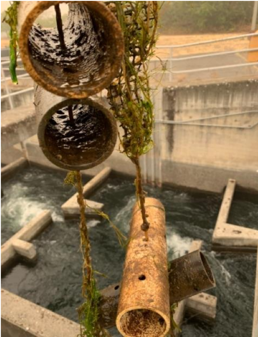
Yes, we have no Zebra mussels! 9/29/2020.